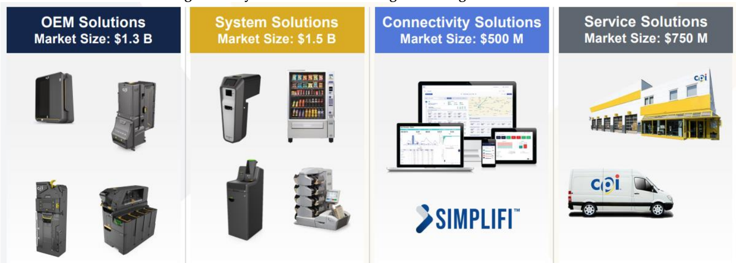
Exhibit 6 Crane Holdings Co.: Payment & Merchandising Technologies Businesses